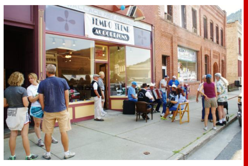
Tempo Trends was open for business from Thursday through Monday in the Cam's Building on Bank Street.