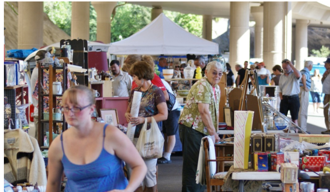
The 2011 Under the Freeway Flea Market & Duck Run

As in past years, the Wallace Rotary will hold its "Running of the Ducks" event at 3 p.m. Sunday. If you haven't adopted your duck, you can do so at their booth for $5 each or $20 for a quackpack of five. First-place winner takes home $500; second place $250 and third, $100. Winners will be announced following the race.