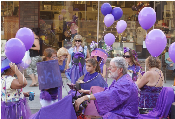
Purple, purple, everywhere.

Purple prevailed as a new event, the Purple Shade Parade, kicked off another successful Huckleberry Festival. Also new this year was a Salsa Challenge, in addition to the traditional Huckleberry Bake-off. The 5K Walk/Run again proved popular, with more than 80 runners. This year's Huckleberry Festival brought a record number of vendors to the streets and Depot lawn.