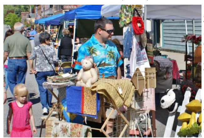
Like 2011, there will be many interesting items at this year's Street Fair.

On the heels of a successful Depot Days celebration comes the annual Downtown